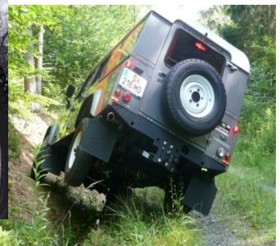
4x4 Drive Training, IPT Core Course 2012