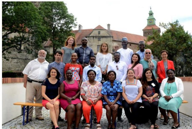
Participants, Staff and Faculty of IPT Specialisation Course, July 2017

You can also find us on Facebook : www.facebook.com/IPT.Schlaining