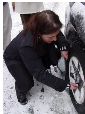
Replacing a wheel in CC 2004